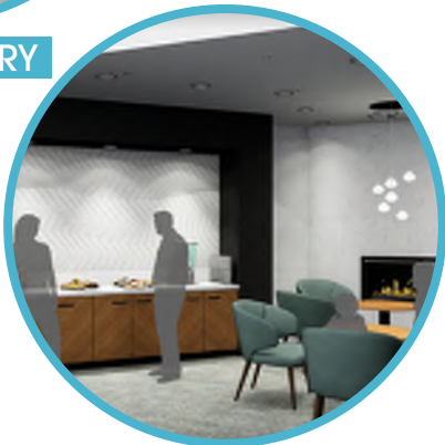
SOFT SEATING - COFFEE